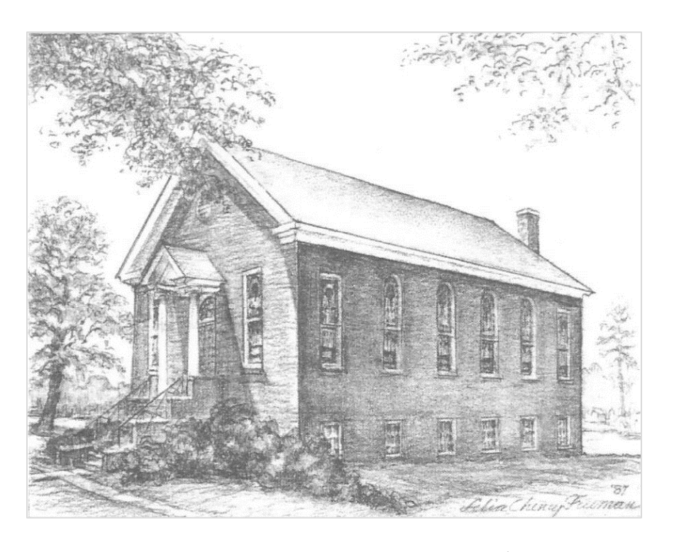
Open Doors, Open Hearts, Open Minds